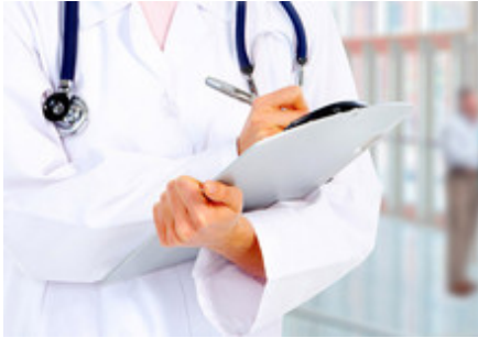
Equipe \Psi R2